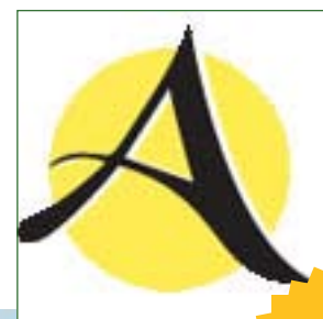
RH Banner Logo Banner Ad (105 x 105 pixels)

for Splash Page and Banner Ads and Newsletter Logo inclusion: